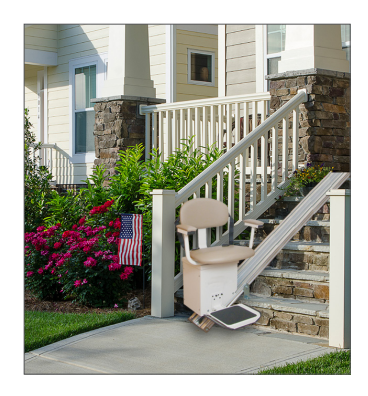
SL350 / SL350OD