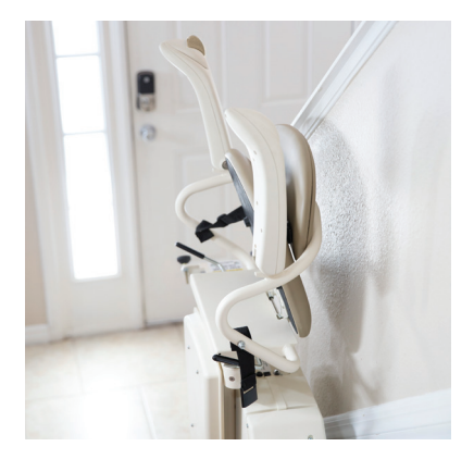
The Pinnacle is the world's most compact stair lift, folding closer to the wall. That means others can pass by easily and more room for you.