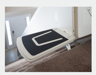
Wide footrests for stability and extra comfort.*

*Wider foot rest vary slightly in style on each Pinnacle model. See model detail for more information.