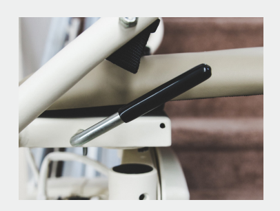
Swivel seat for a safe exit