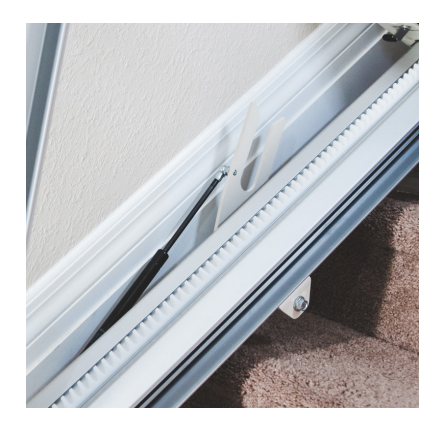
Nylon Polymer Gear Rack with steel reinforcement. Lubrication free. That means durability and no track maintenance.