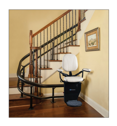
Curved Stair Lifts