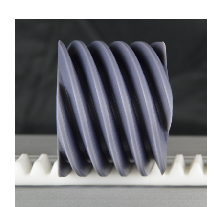
Oversized Helical Worm Gear with six points of contact for an energy efficient low friction design. That means a smooth and stable ride.

If these concerns are weighing on you, consider Harmar's SL600 and SL600HD. These lifts boast a 350 lb or 600 lb weight capacity for peace of mind knowing your lift is capable to handle your needs.