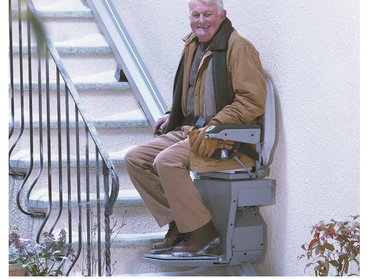
To use the Stannah 320, simply unfold it, sit down and gently move the joystick on the end of the arm-rest in the direction you want to travel.

With its narrow rail and slim design, the 320 stairlift provides a space-saving way to access your driveway, deck or yard.