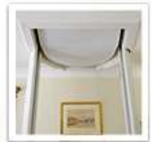
View of downstairs looking up at underside of the lift.