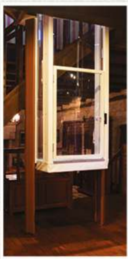
Travel in under 30 seconds