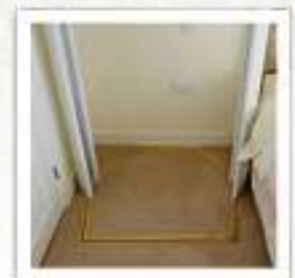
View of upstairs looking at the safety lid plug.

The lift uses an optical sensor to detect the speed of travel. If this increases beyond the specified limit, the lift will stop.