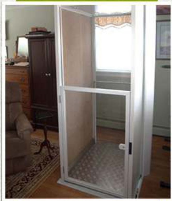
Trio Vista with clear polycarbonate back