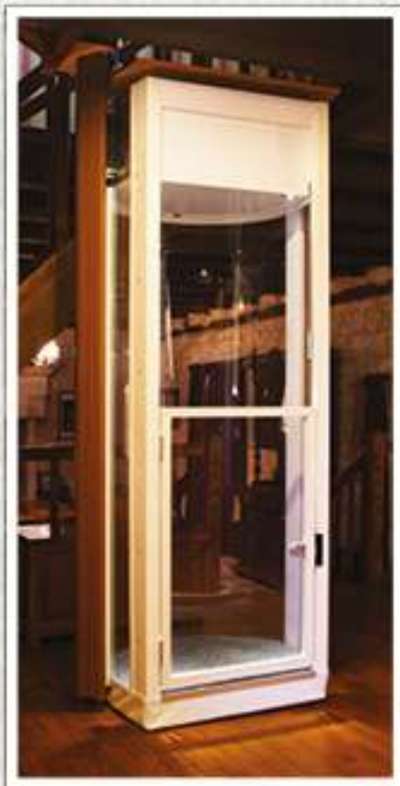
Attractive in any environment