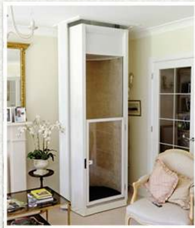
Duo Classic with cream carpet interior