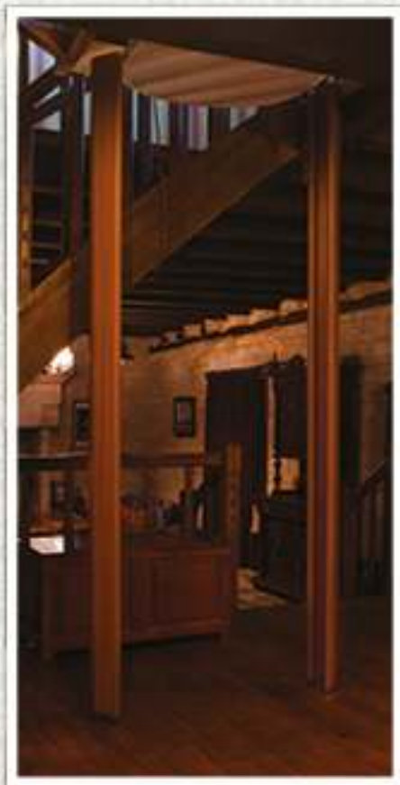
Non-intrusive structural design