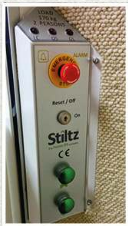
Stiltz Duo control panel